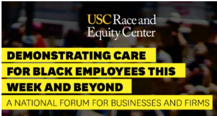
A 90-minute panel discussion organized by USC Race and Equity Center