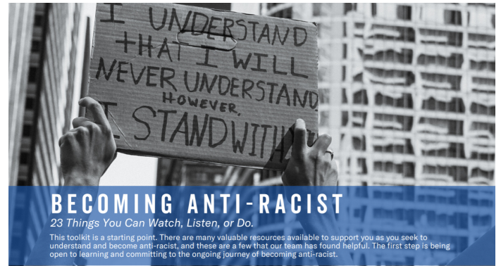
Compiled by ChicagoBeyond.org